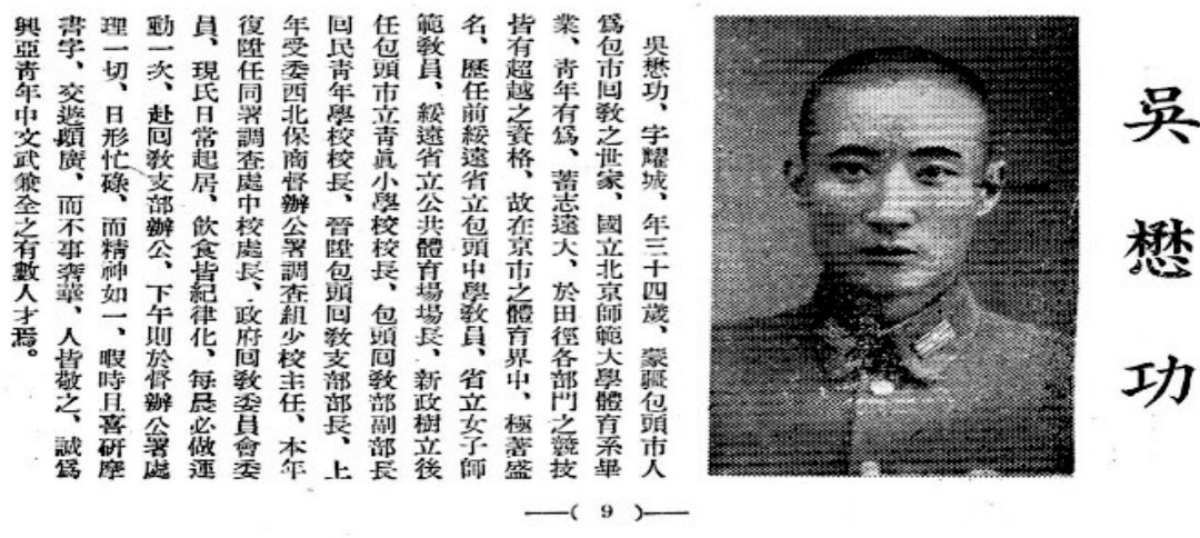
Fig. 2. Wu Yaocheng's photo and biographical introduction in the Mengjiang publication For the People Semimonthly (《利民》半月刊) 1(1941): 9.