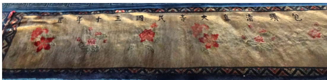
Fig. 3. This carpet was found in the Baotou Great Mosque in the summer of 2013. It marked the 30th year of the Republic of China, instead of the 736th year of Genghis Khan.